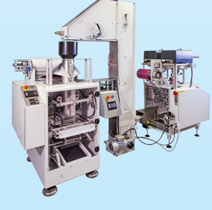
SC-9100H2 feeding sachets into a SC-9225P big bag maker. This system is the foundation of the Mini BPS.