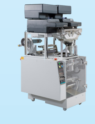
SC-9100H2 with coin fed to both counting head from a SCAN COIN bulk coin lift.

The SC-9100H2 unit with twin counting heads and escrow system produces up to 80 sachets per minute.